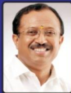
Sri V. MURALEEDARAN HONOURABLE MINISTER OF PARLIAMENTARY AFFAIRS