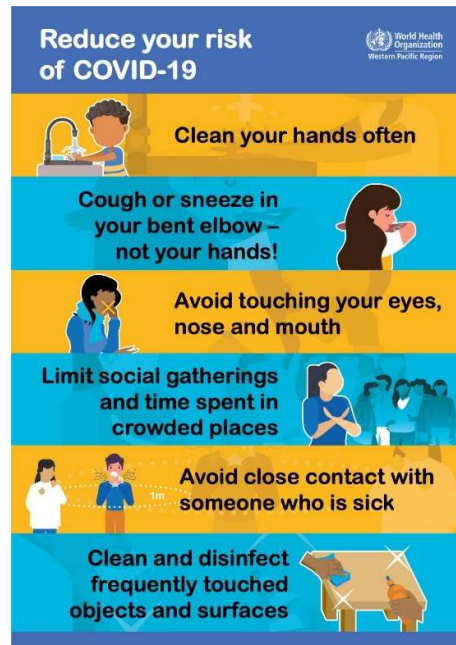
Figure 2. An infographic material for public safety - Reduce your risk of COVID-19.

All countries have carried out awareness campaigns. All of them have published some recommendations, have been speaking about it on the media, and have been continuously informing people of the development of the crisis.